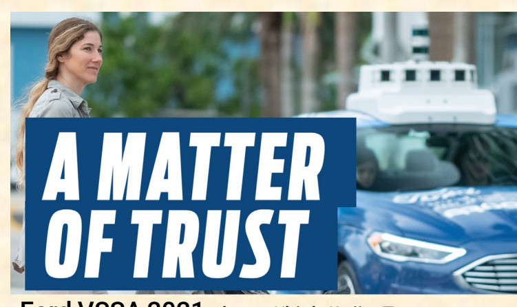
Ford VSSA 2021 https://bit.ly/3njionT