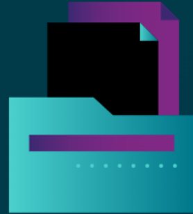
Securing Development Environments